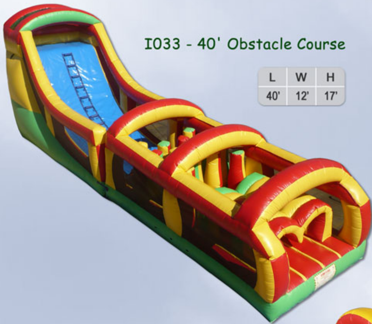
I033 - 40' Obstacle Course