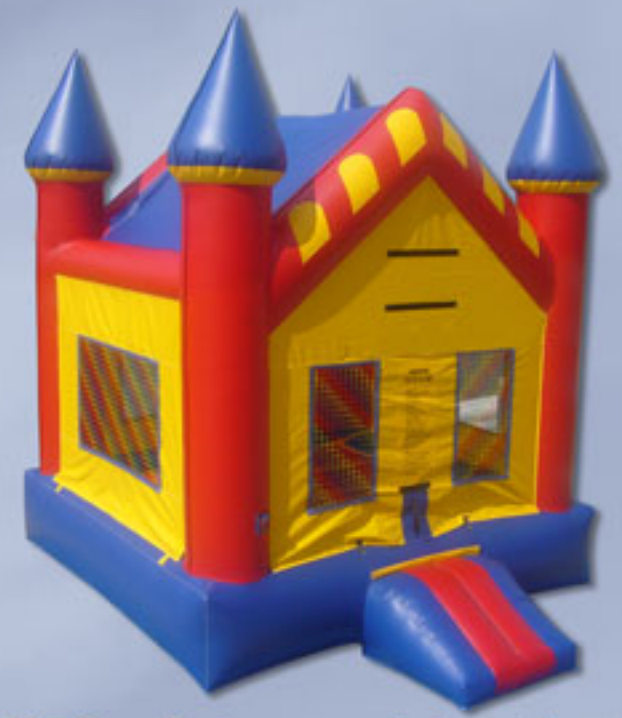
J050 - Primary-Color Castle