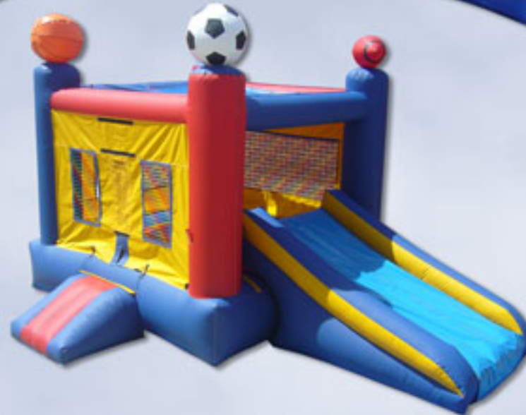
C043 - 2 in 1 Mini Sports Combo