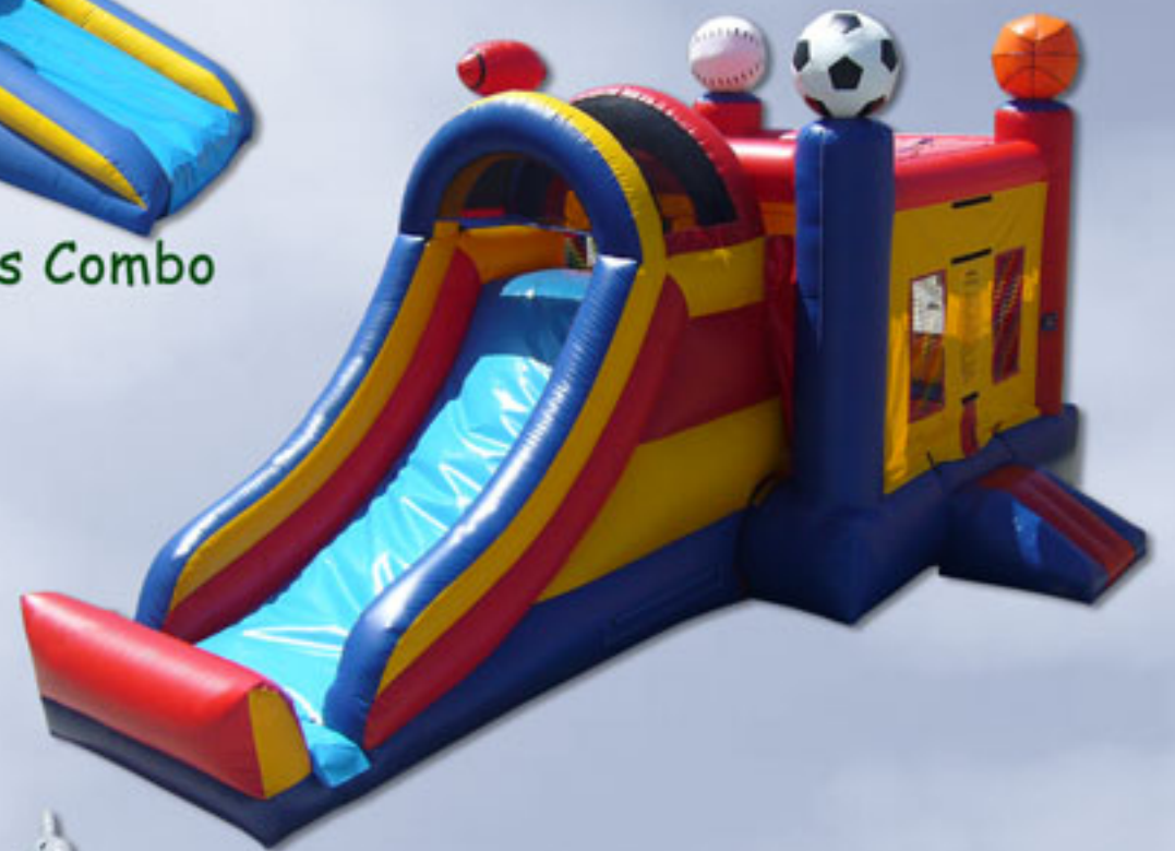
C023 - 3 in 1 Classic Sports Combo