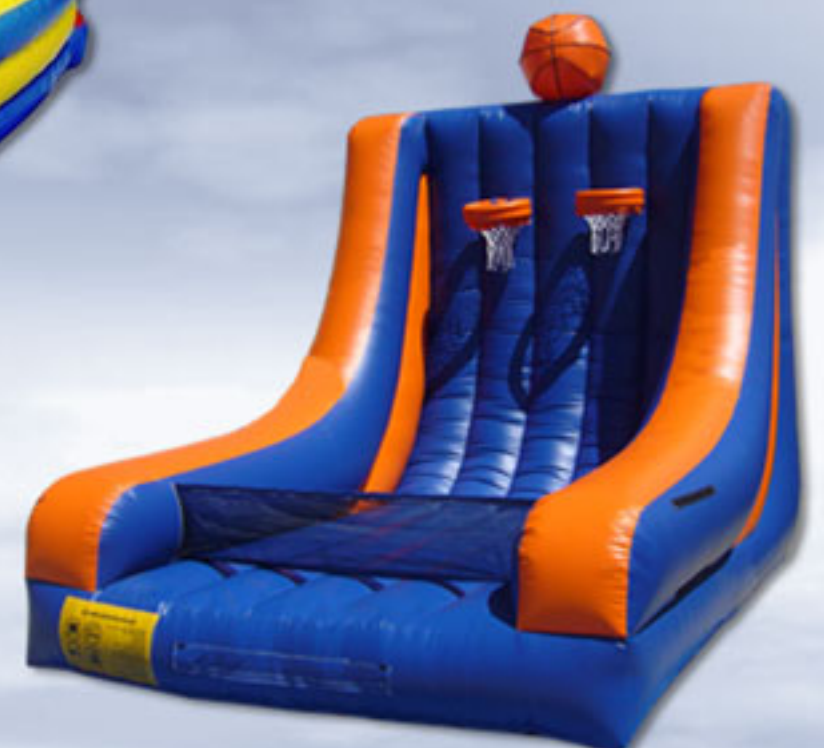
I021 - Double Basketball