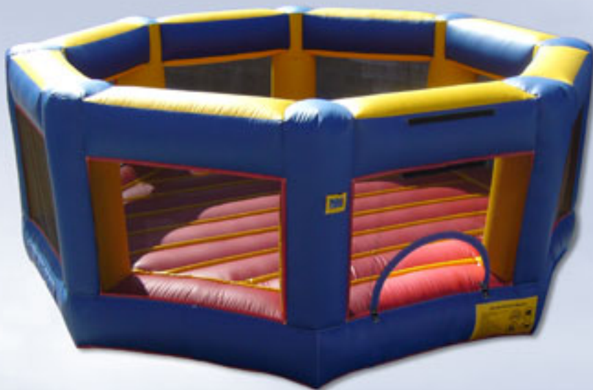
I030 - Octagon Ring