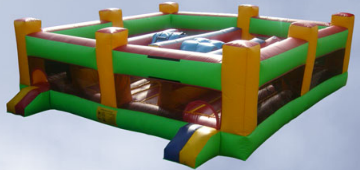
I028 - 5 in 1 Obstacle Playland