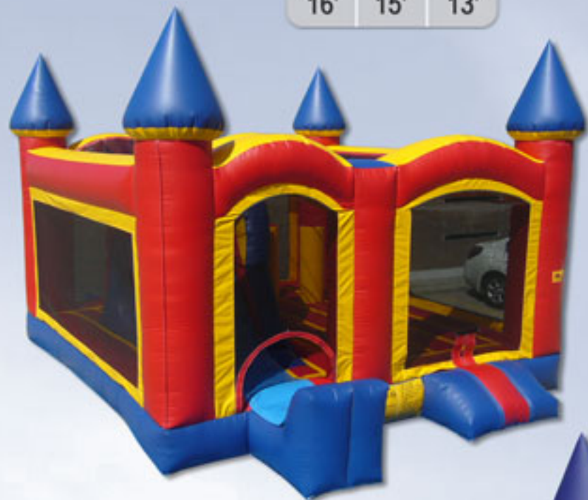
C050 - 5 in 1 Castle Combo