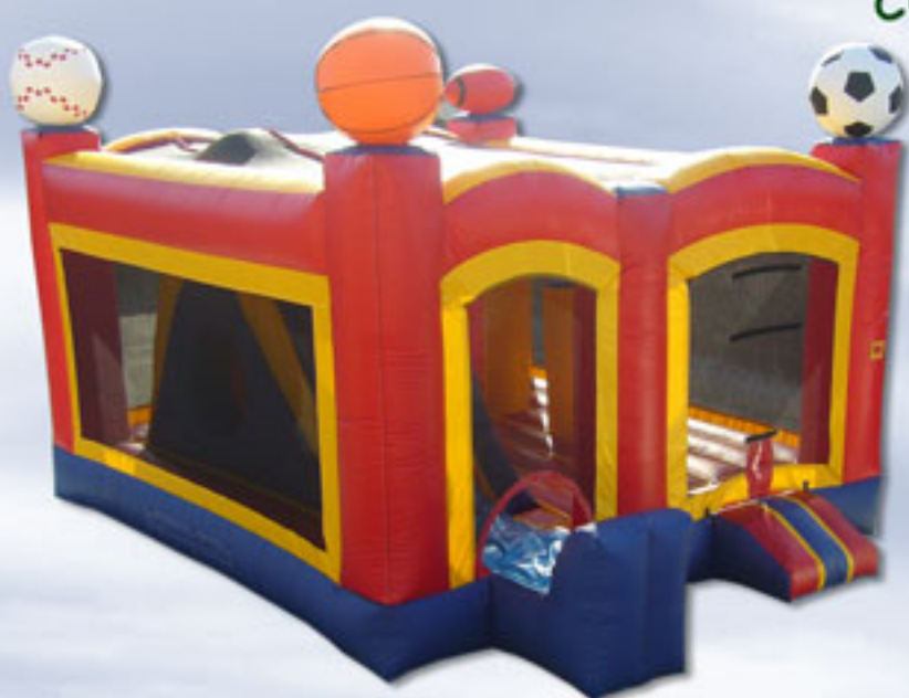
C054 - 5 in 1 Sports Combo