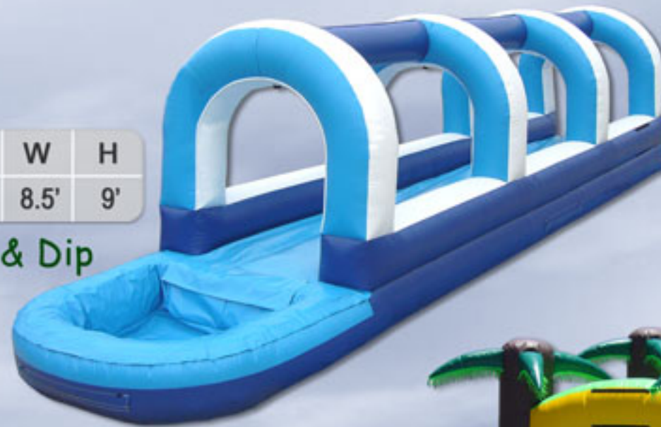
W013 - Single Lane Slip & Dip