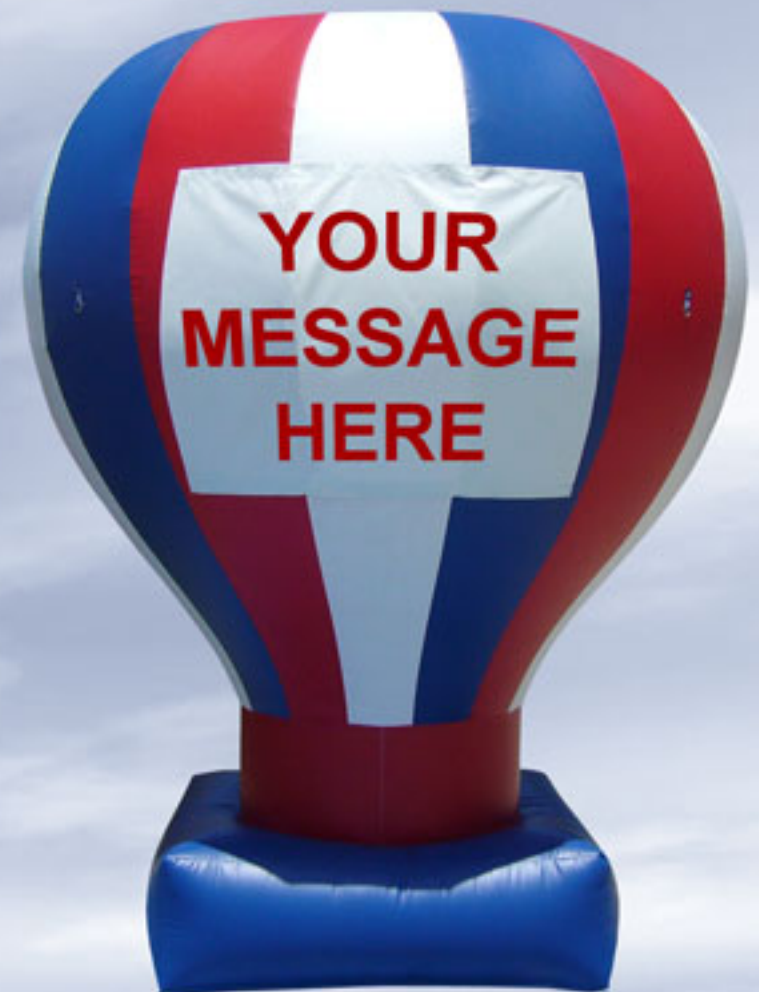
B013 - 15' Adveertising Balloon