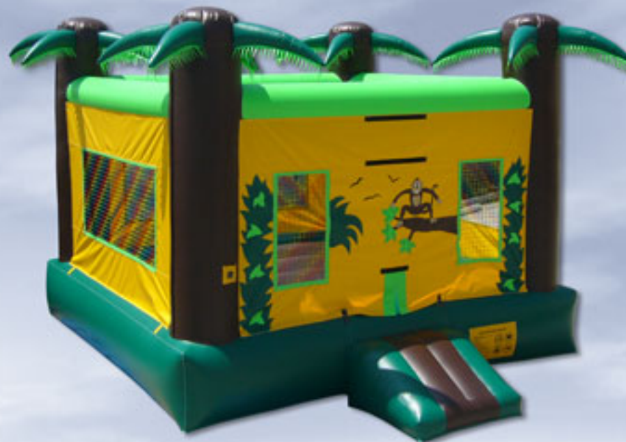
J077 - Tropical