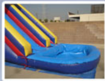
W027 - 18' Front Load Wet/Dry Slide