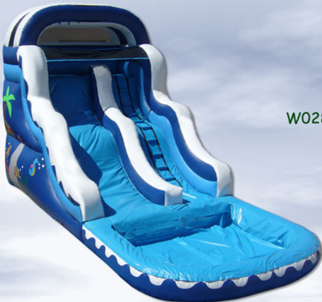
W028 - 16' Wavy Water Slide