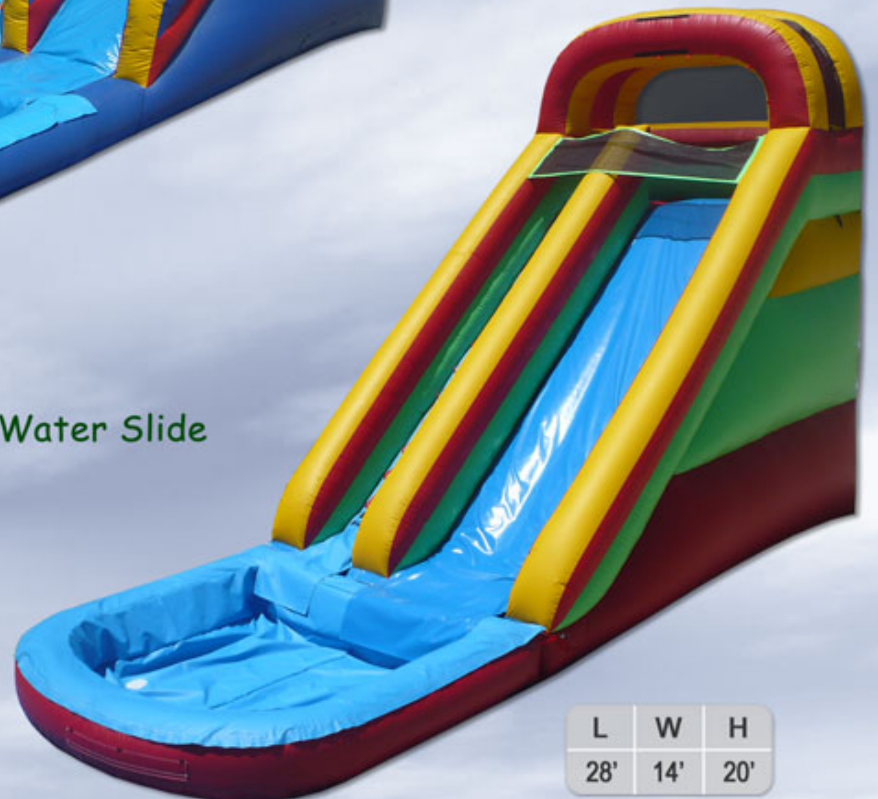
W039 - 20' Front Load Water Slide