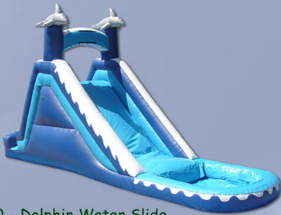
W010 - Dolphin Water Slide