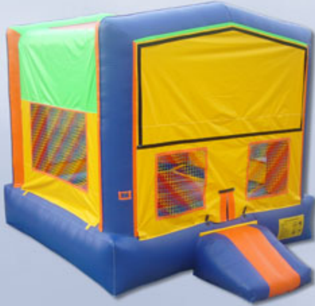
J079 - Module House