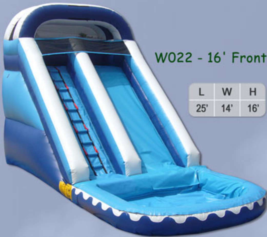
W022 - 16' Front Load Water Slide