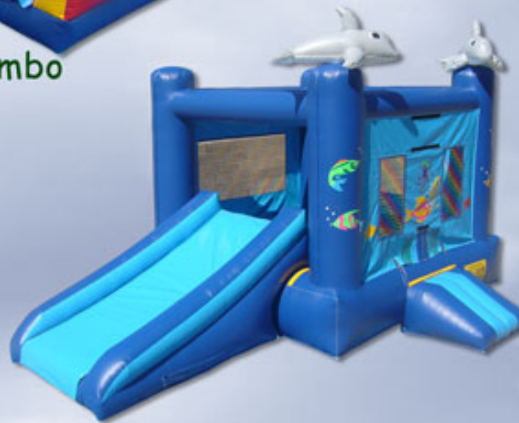
C036 - 2 in 1 Sea World Combo