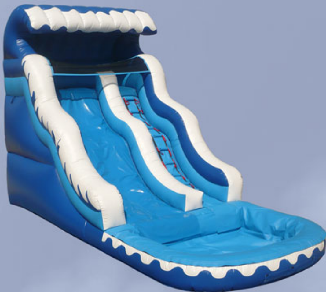
W040 - 17' Ocean Wave Water Slide