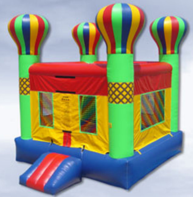
J061 - Adventure Balloon