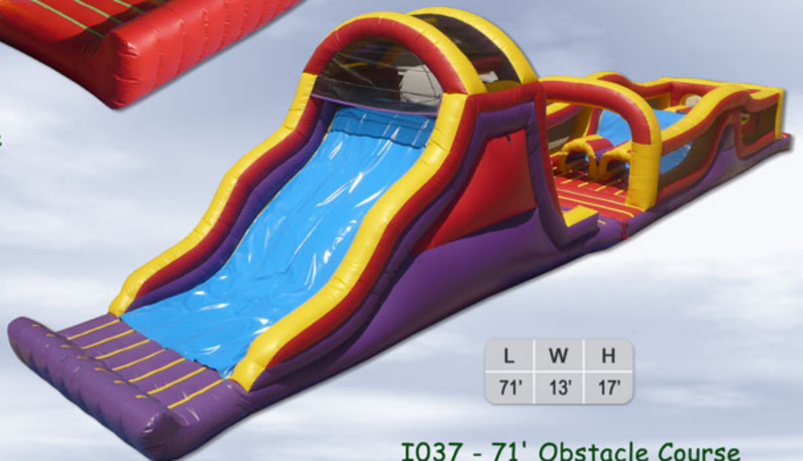
I035 - The Y-Obstacle Course