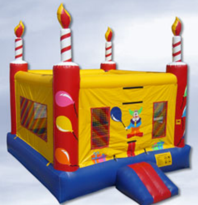
J076 - Birthday Cake