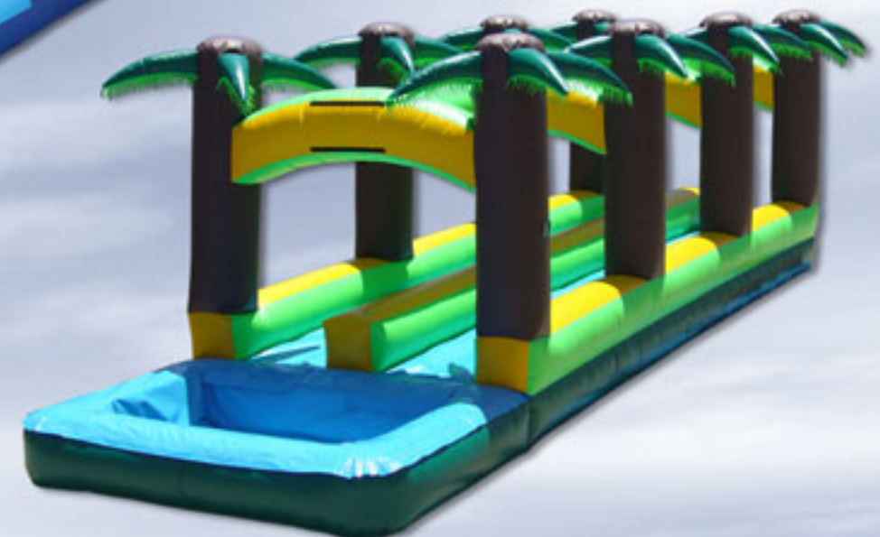
W012 - Double Lane Tropical Slip & Dip