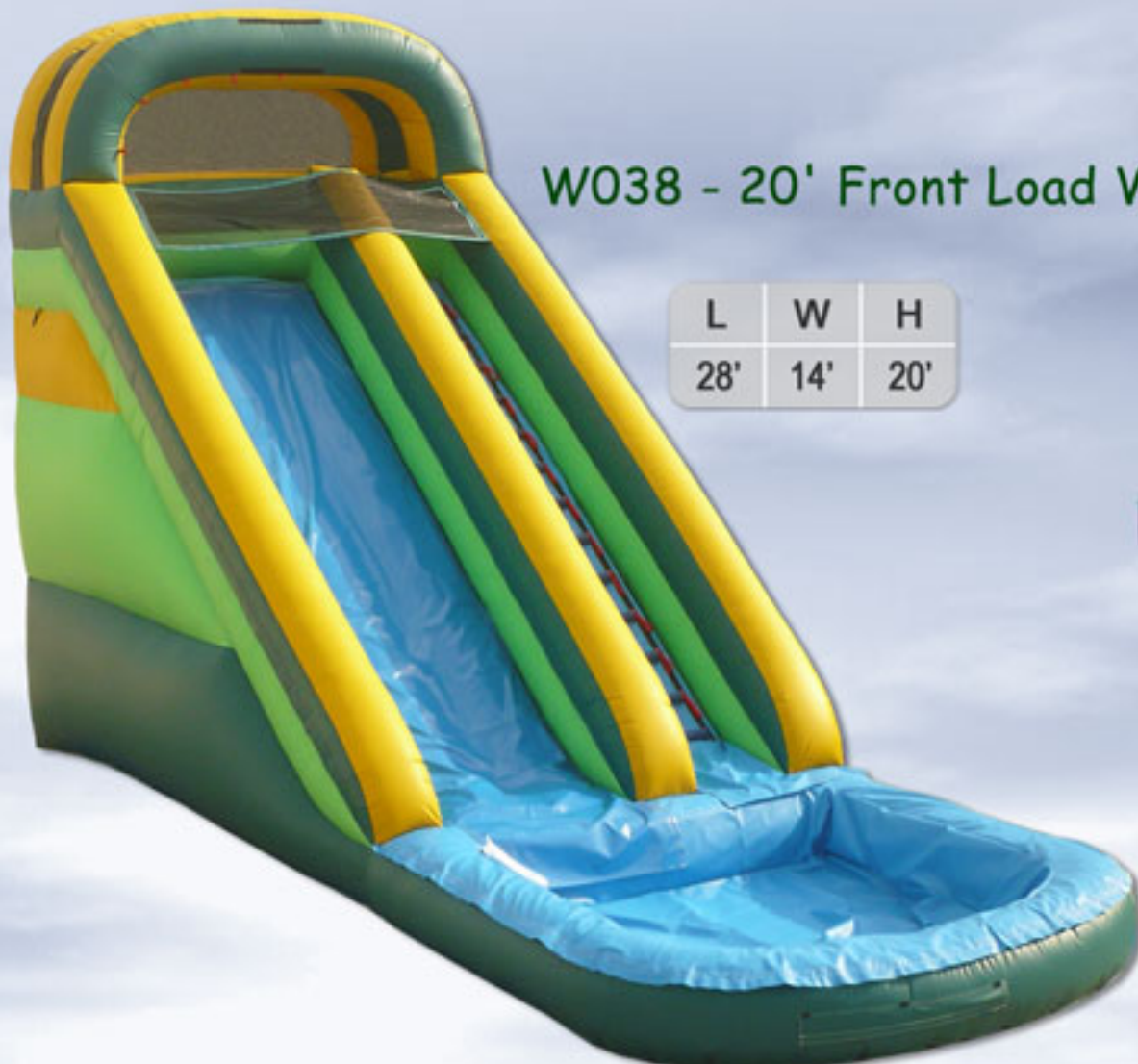
W038 - 20' Front Load Water Slide