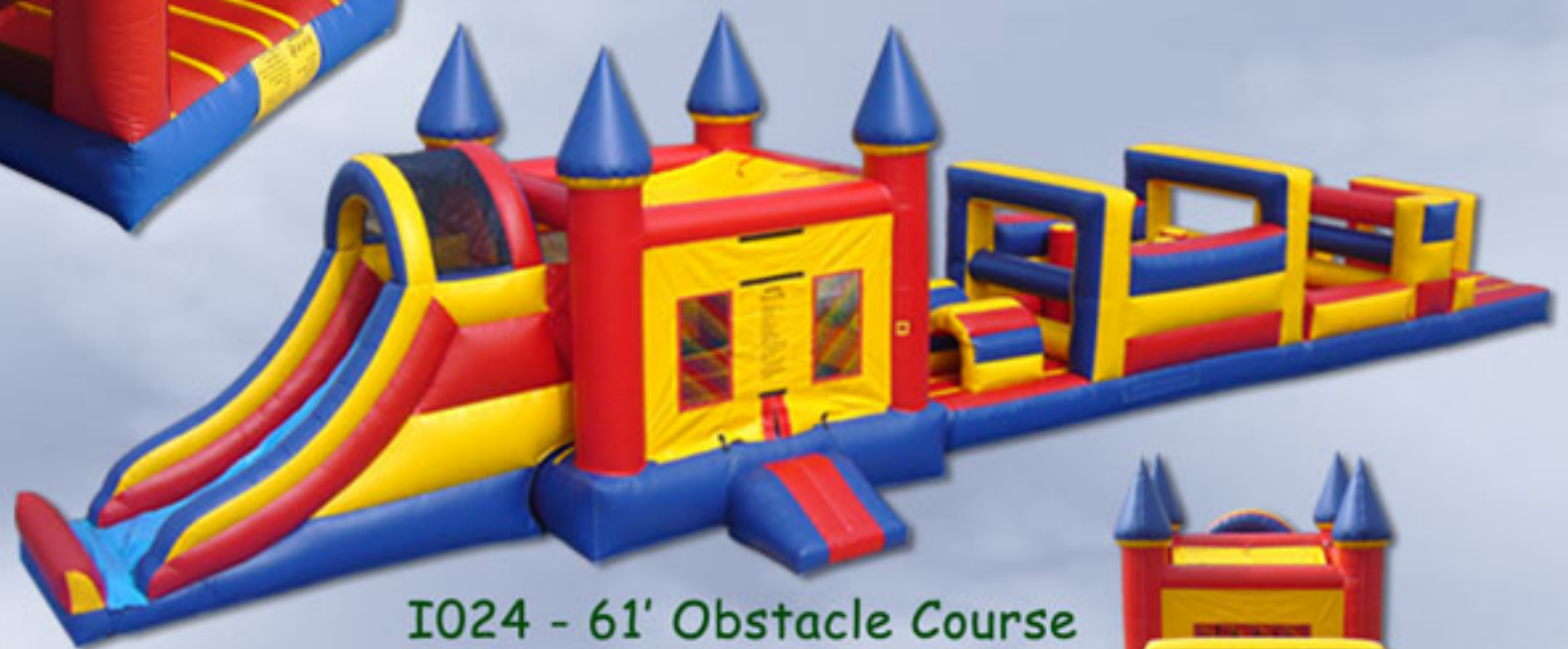
I024 - 61' Obstacle Course