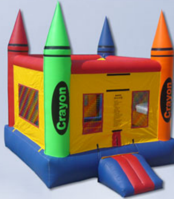
J092 - Crayon