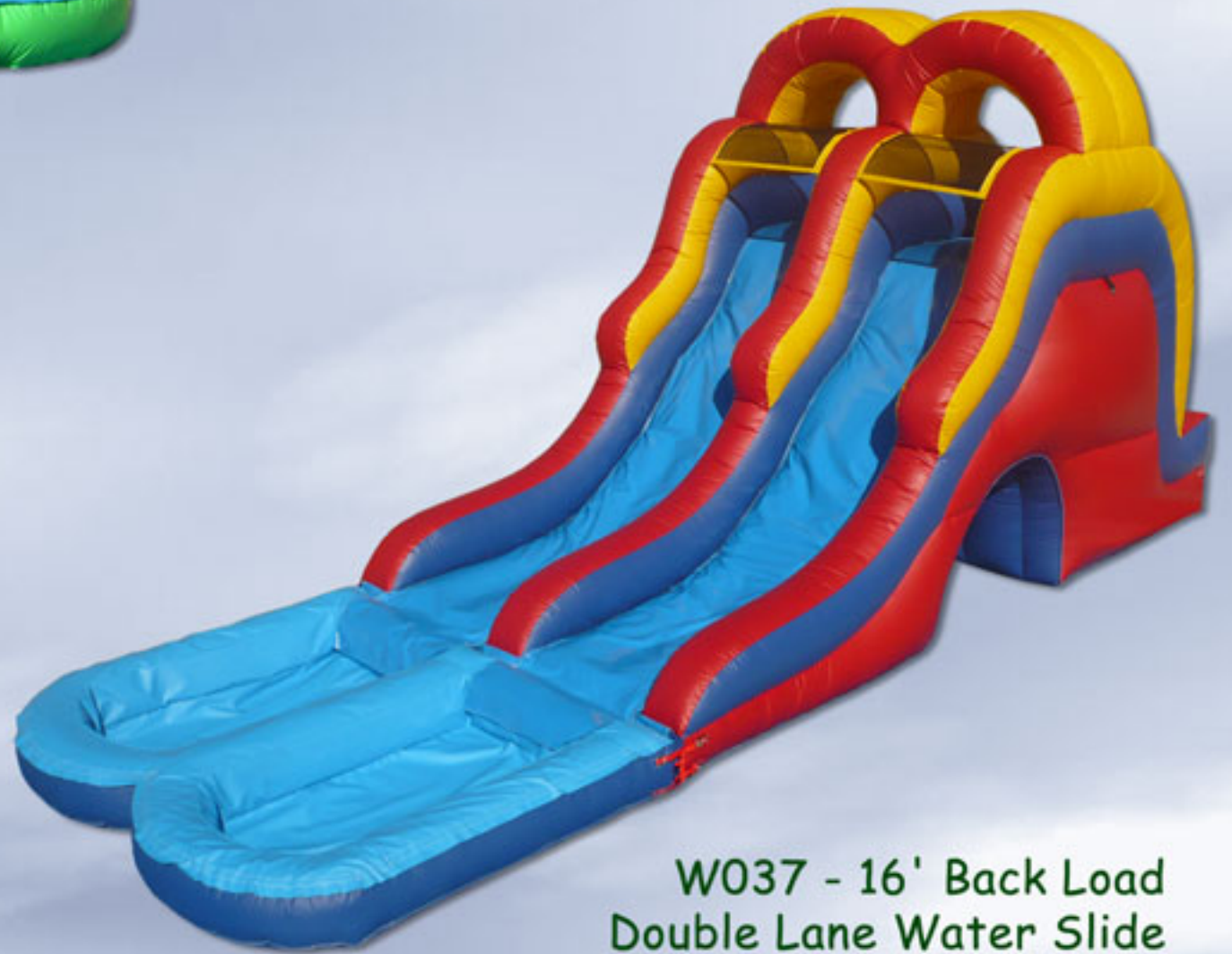
W037 - 16' Back Load Double Lane Water Slide