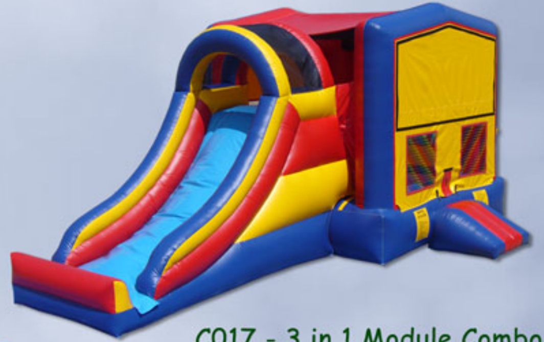
C017 - 3 in 1 Module Combo