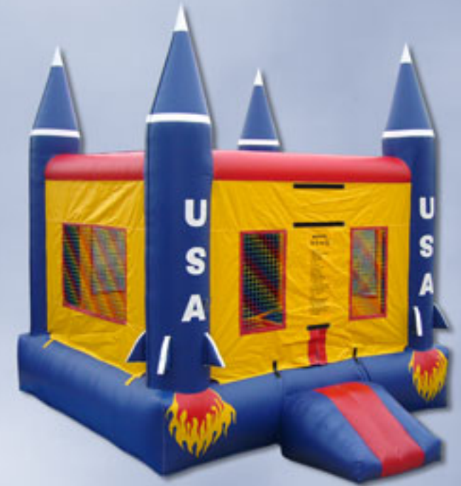
J069 - Rocket Ship