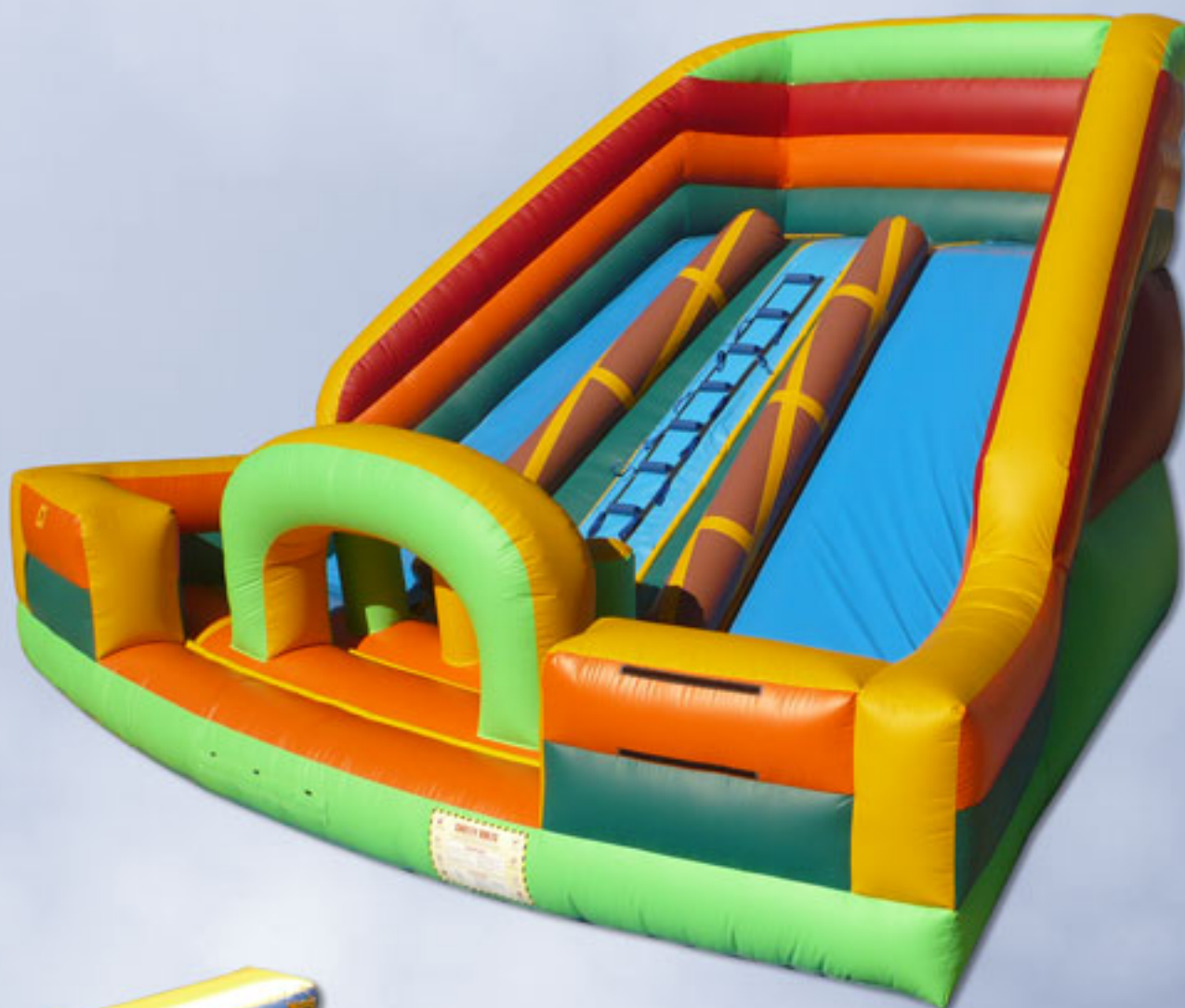
S041 - Ultimate Slide-N-Play