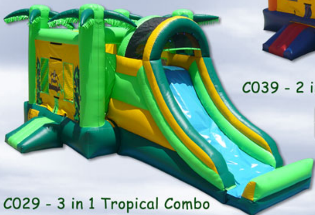
C029 - 3 in 1 Tropical Combo