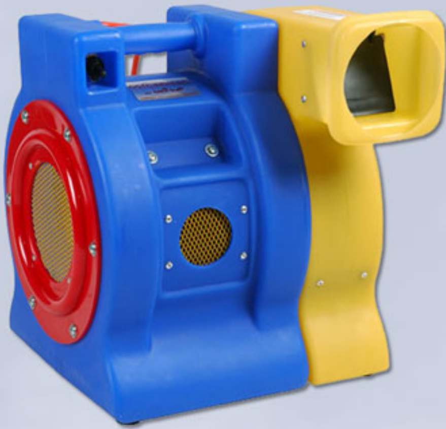
A011 - Air Eagle Pro 1hp or 1.5hp