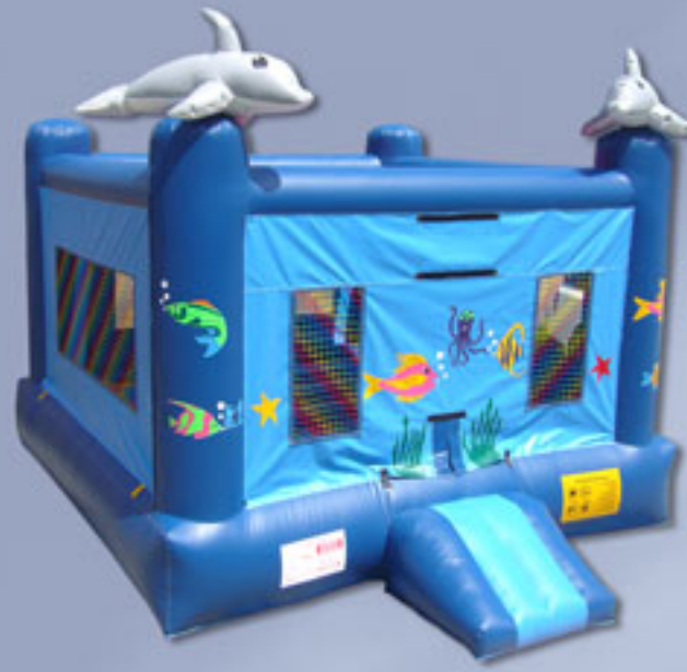
J070 - Sea World