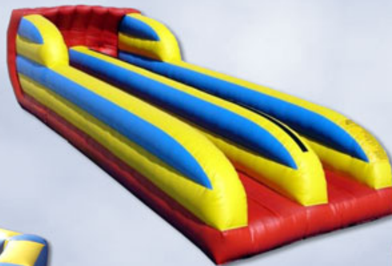
I017 - Bungee Run