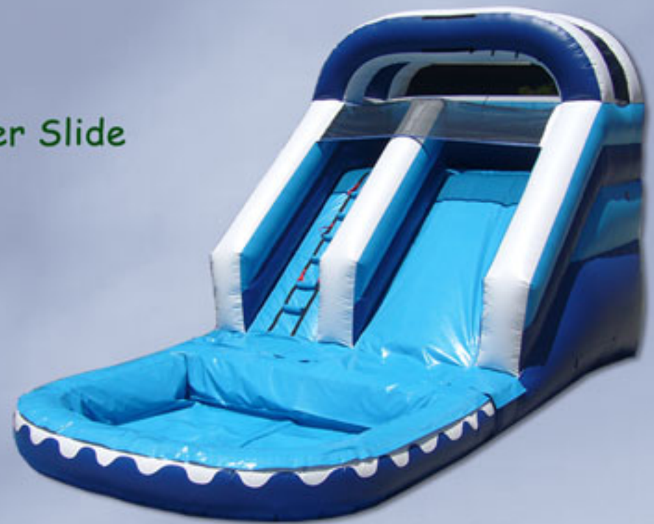
W020 - 14' Water Slide