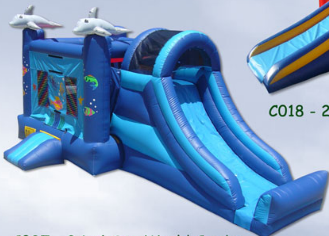
C037 - 3 in 1 Sea World Combo