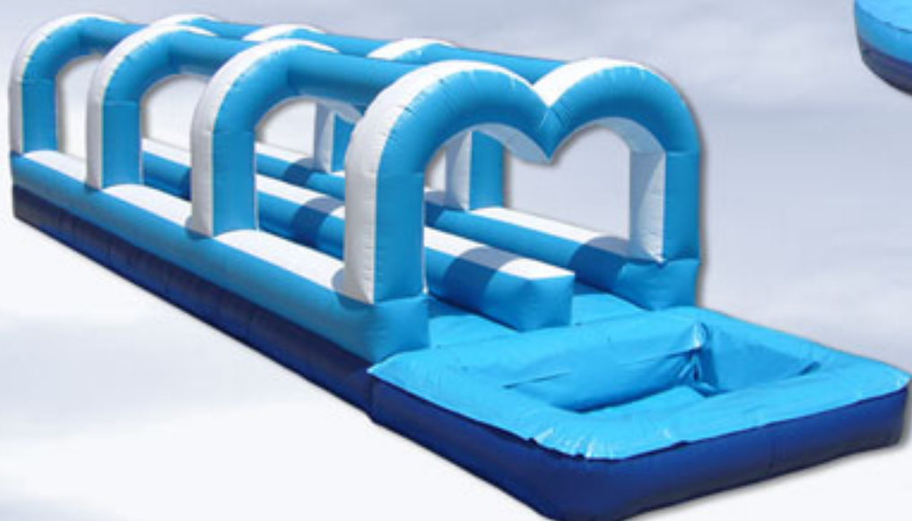
W021 - Double Lane Slip & Dip