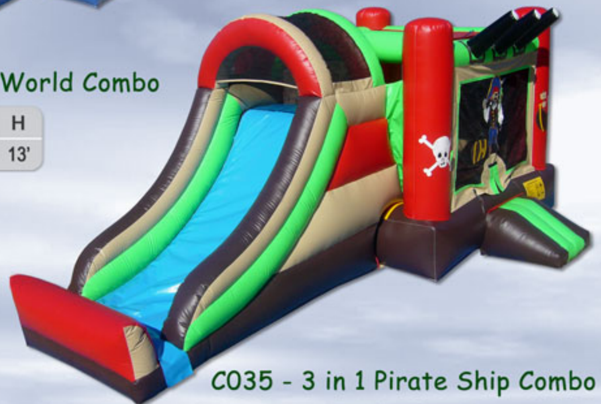
C035 - 3 in 1 Pirate Ship Combo