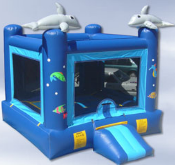
J091 - Sea World