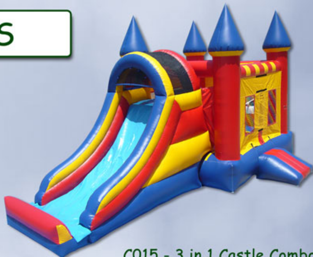
C015 - 3 in 1 Castle Combo