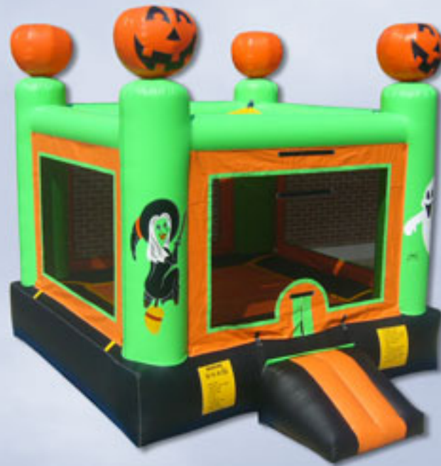
J080 - Jack O' Lantern