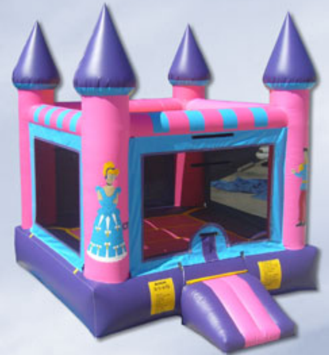
J090 - Princess Castle