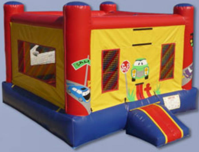
J082 - Racer