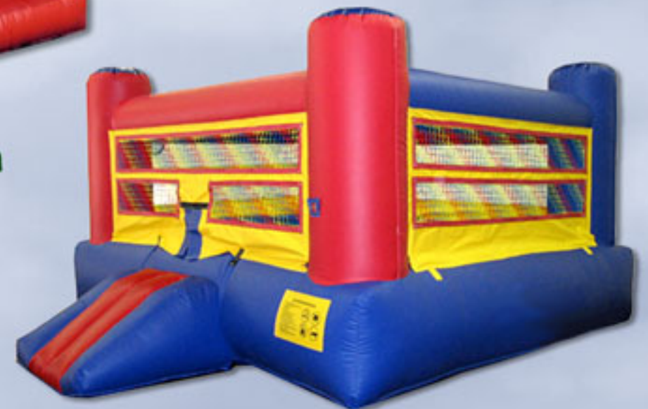
I015 - Boxing Ring