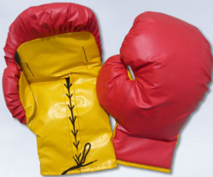
A013 - Boxing Gloves