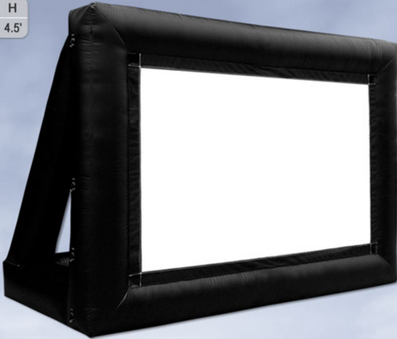
M013 - Jumbo Movie Screen