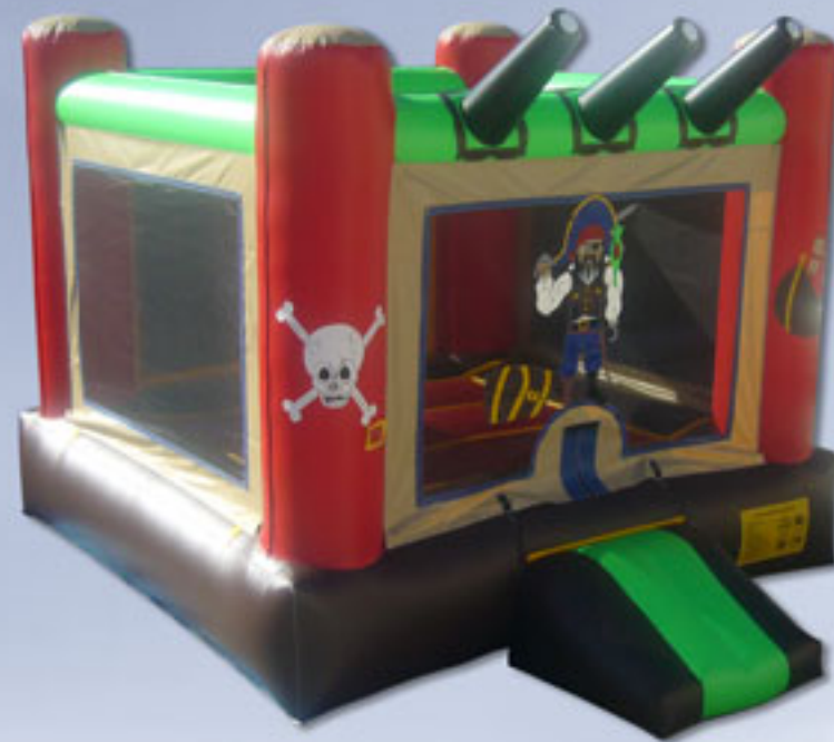
J078 - Pirate Ship