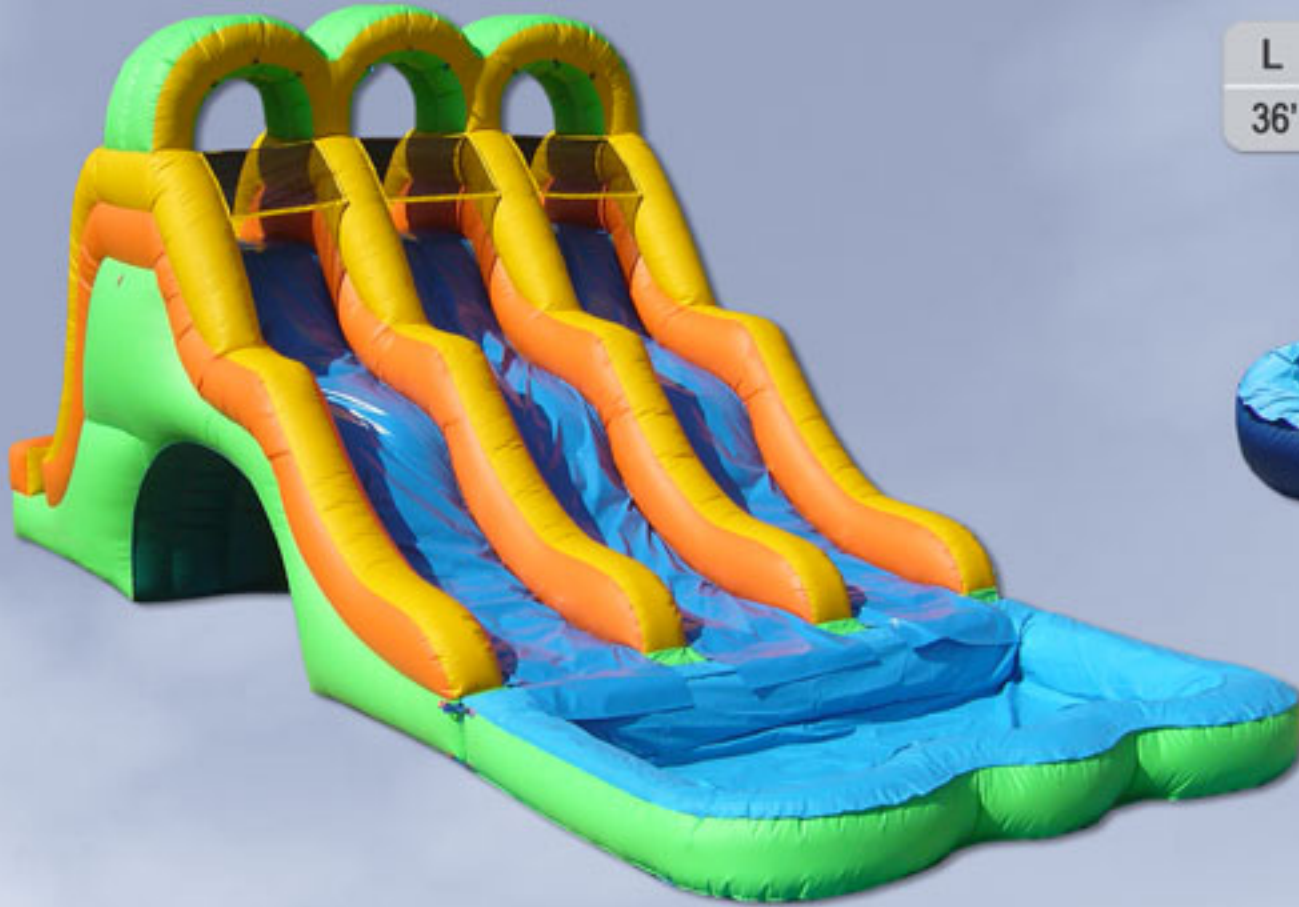
W033 - 18' Triple Lane Water Slide