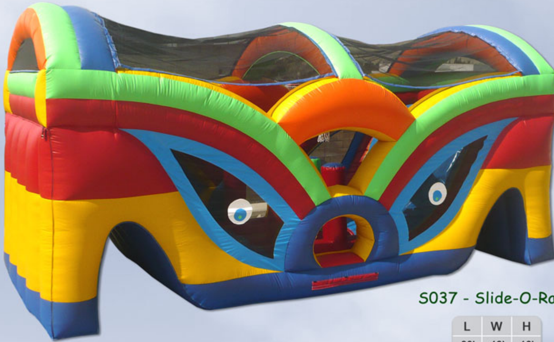
S037 - Slide-O-Rama