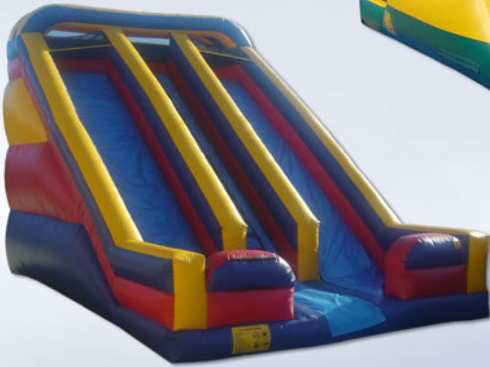
S029 - 22' Double Lane Slide