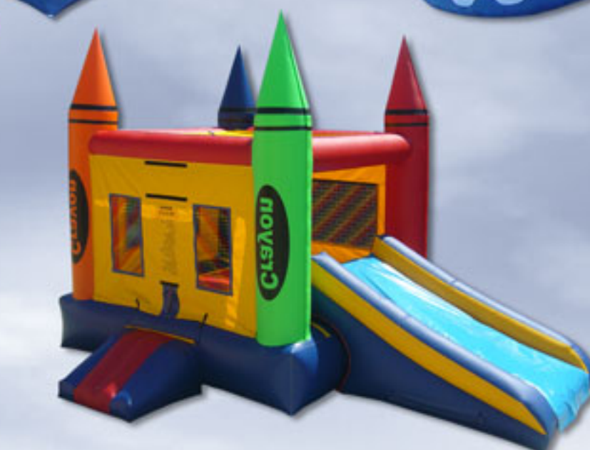
C039 - 2 in 1 Mini Crayon Combo