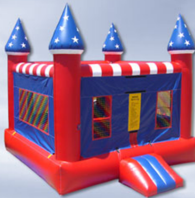
J074 - Patriotic Castle