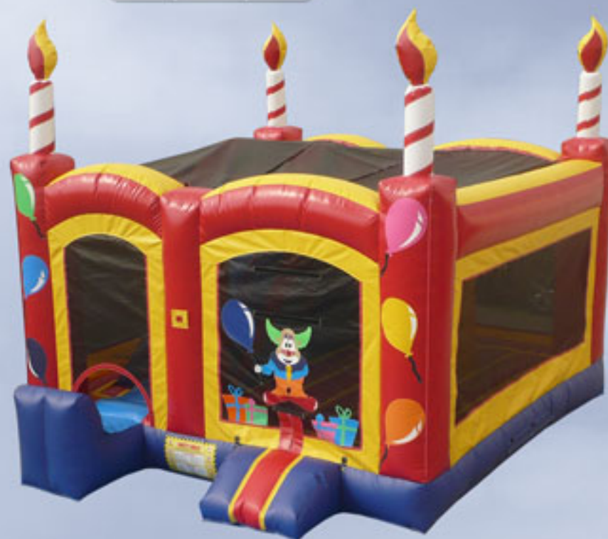
C056 - 5 in 1 Birthday Cake Combo