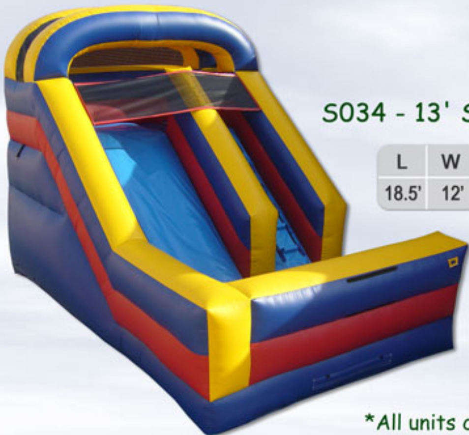
S034 - 13' Single Lane Slide