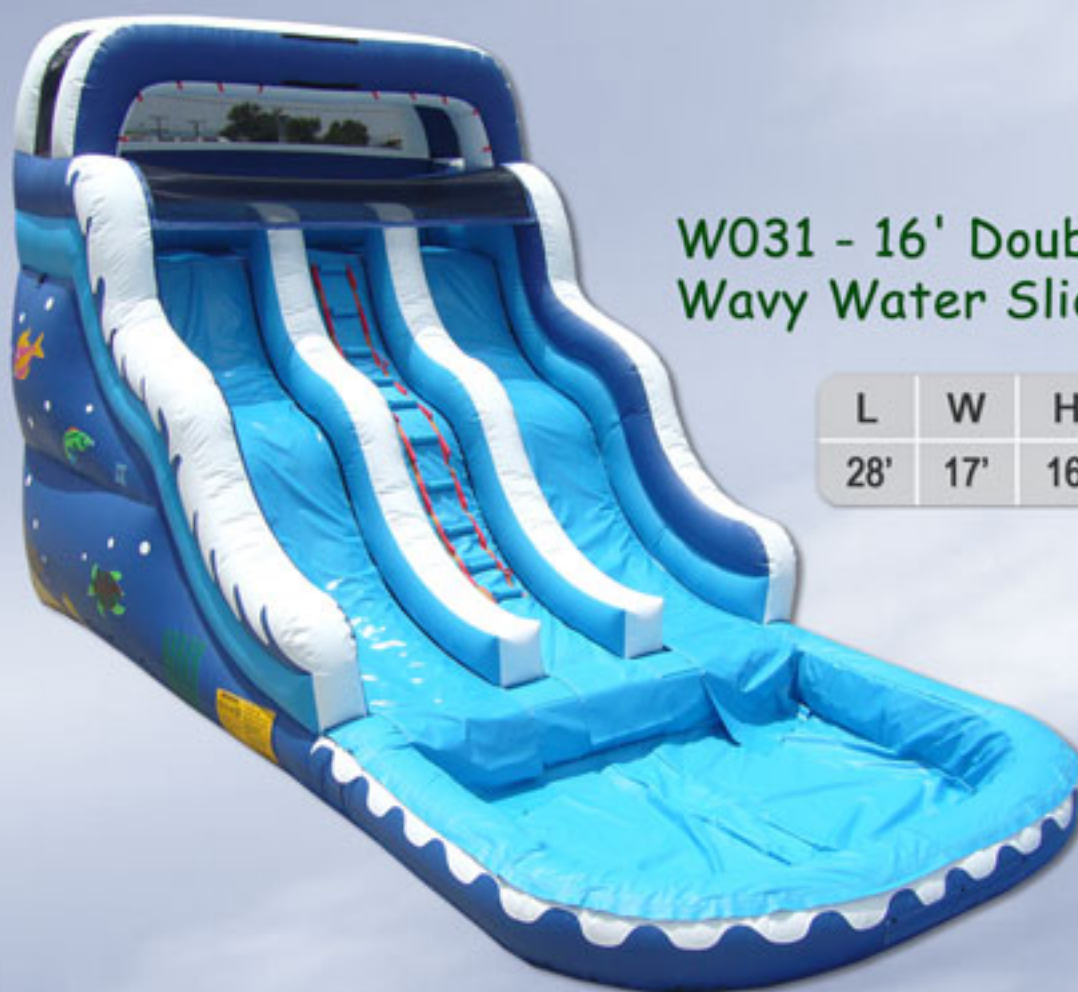
W031 - 16' Double Lane Wavy Water Slide