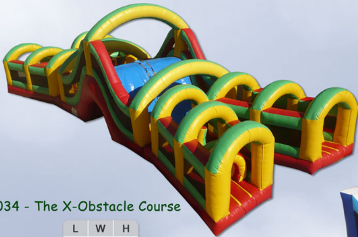
I034 - The X-Obstacle Course