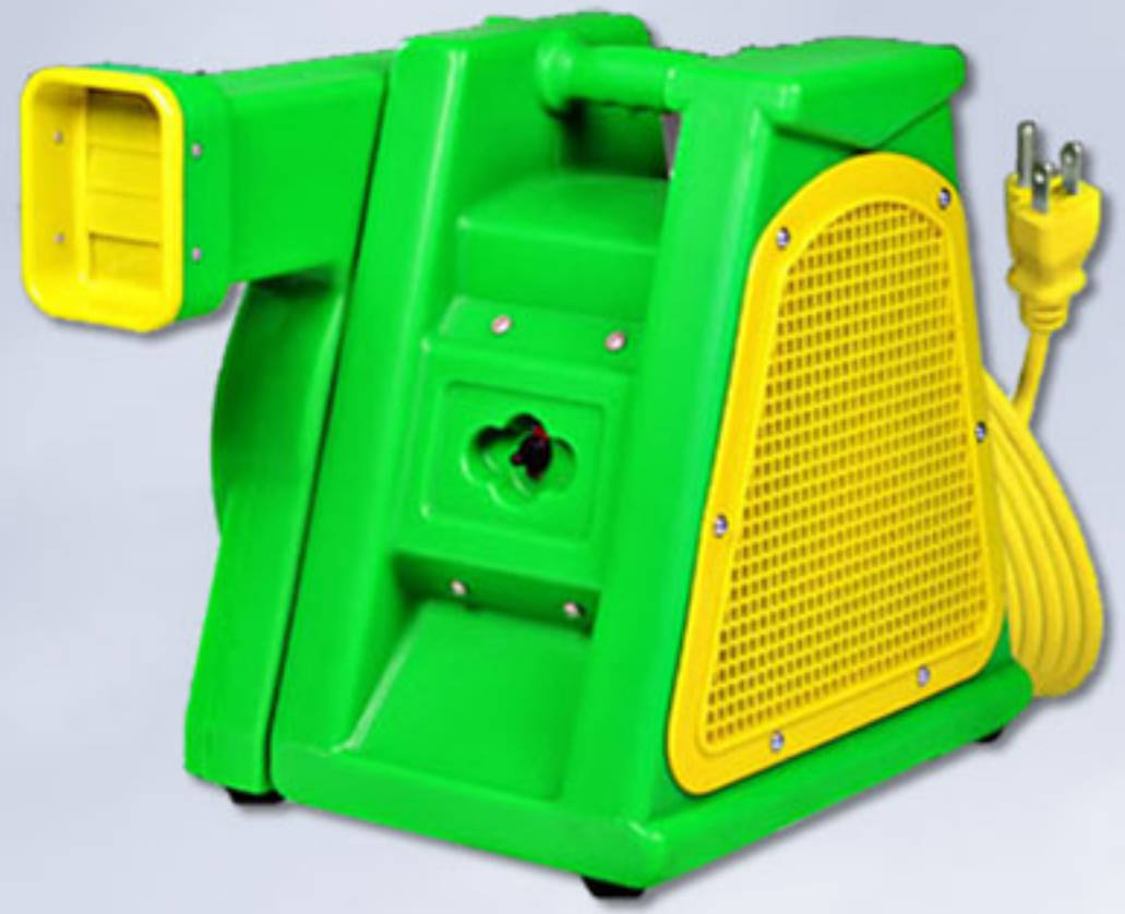
A012 - Bear Blower 1hp or 1.5hp