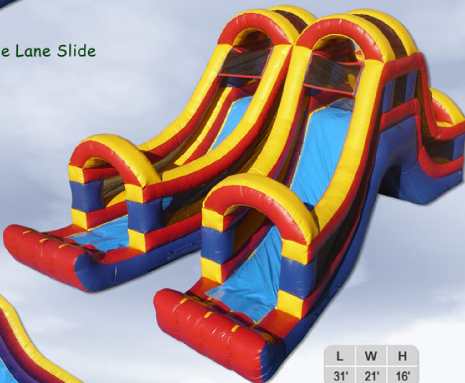
S043 - 16' Back Load Double-up Slide