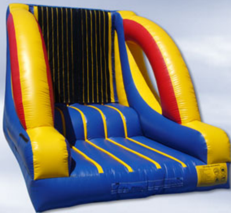
I020 - Velcro Wall