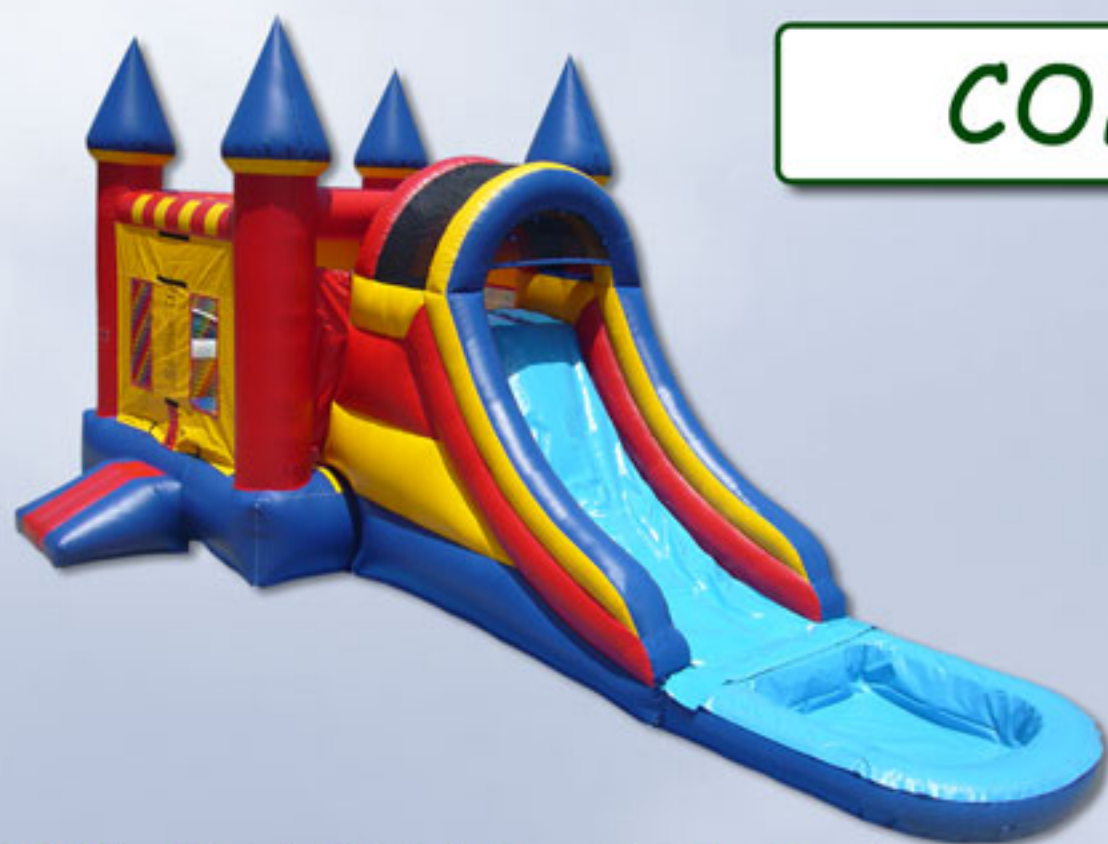
C019 - 3 in 1 Wet & Dry Castle Combo