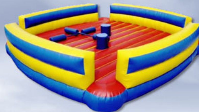
I014 - Joust Arena