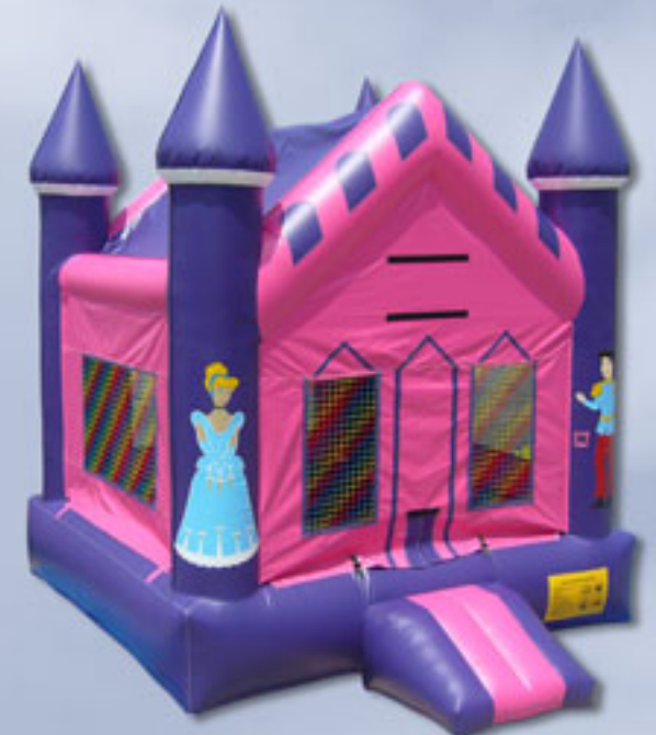
J049 - Princess Castle