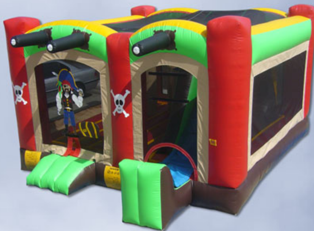
C053 - 5 in 1 Pirate Ship Combo