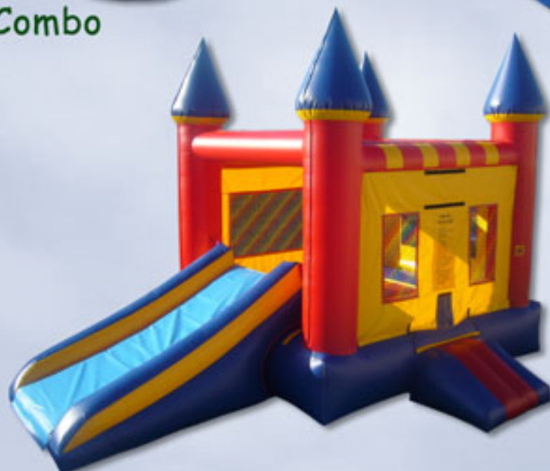
C018 - 2 in 1 Mini Castle Combo