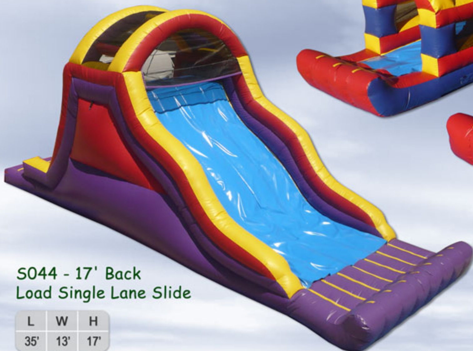
S044 - 17' Back Load Single Lane Slide