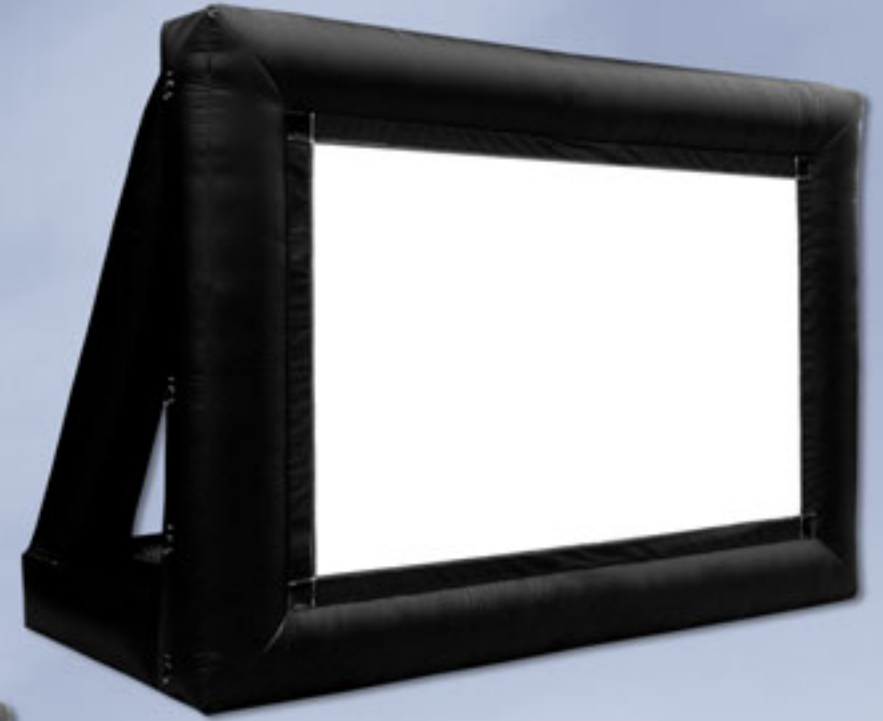
M012 - Large Movie Screen