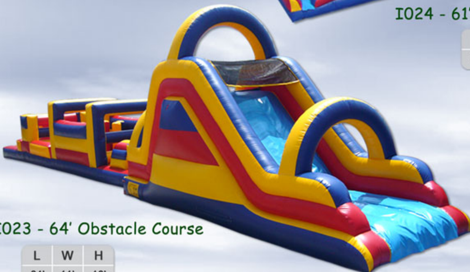
I023 - 64' Obstacle Course