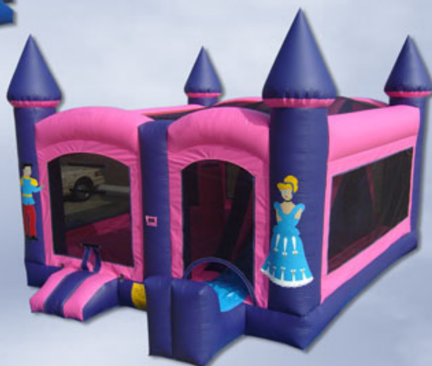
C055 - 5 in 1 Princess Combo