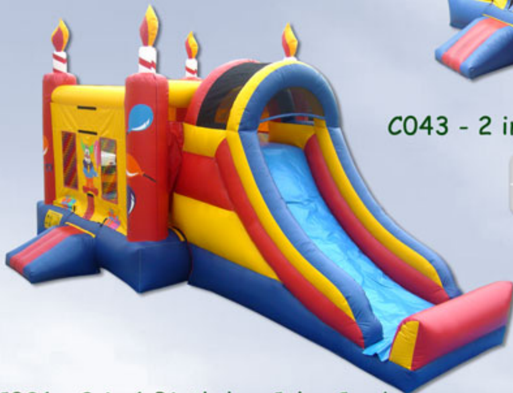
C031 - 3 in 1 Birthday Cake Combo