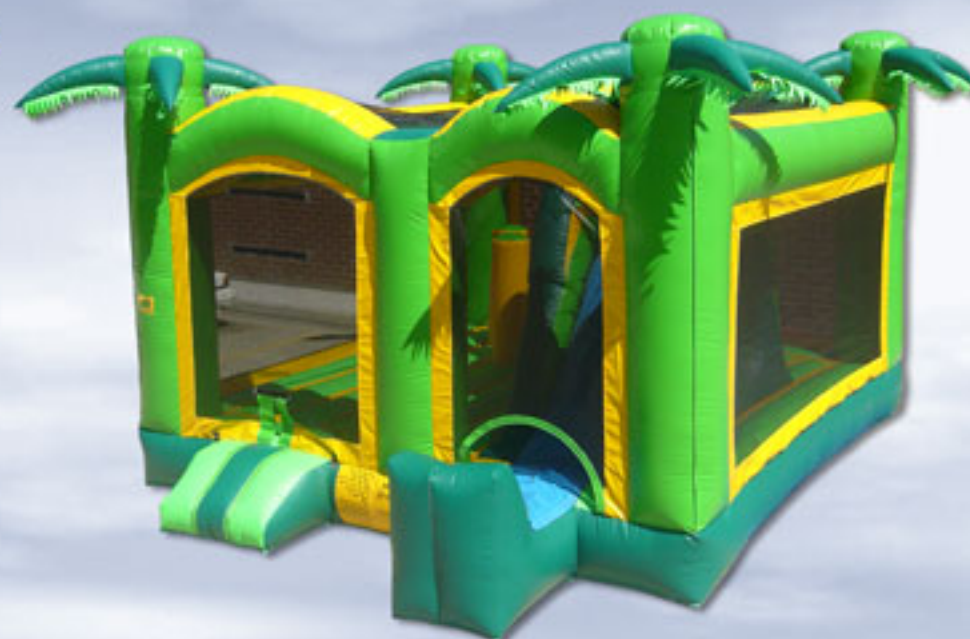
C051 - 5 in 1 Tropical Combo