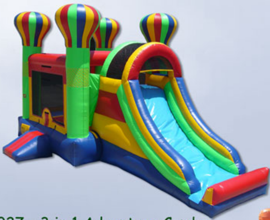
C027 - 3 in 1 Adventure Combo