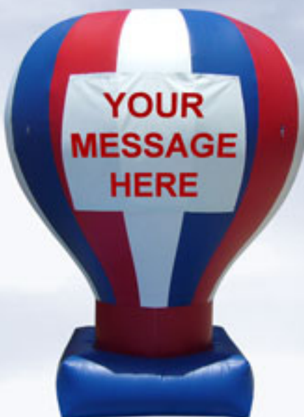
B011 - 10' Adveertising Balloon