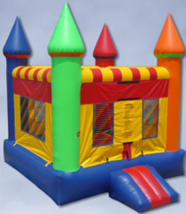
J044 - Multi-Color Castle