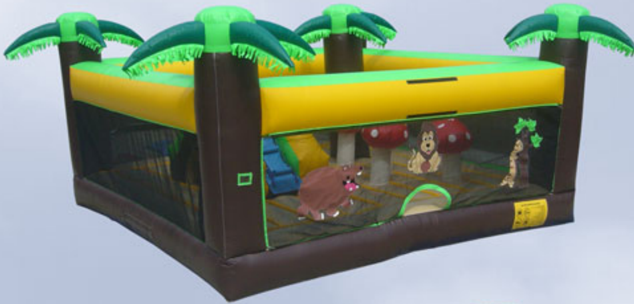
I027 - Ultimate Safari