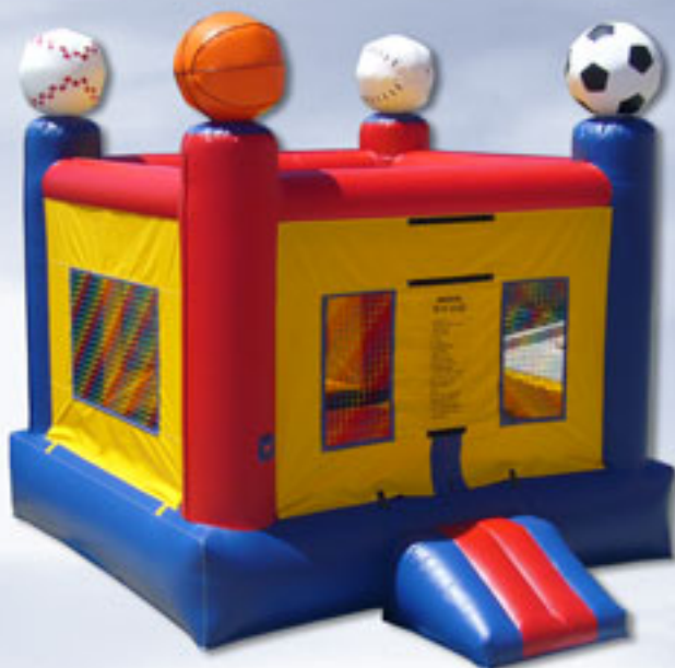
J063 - Sports Arena