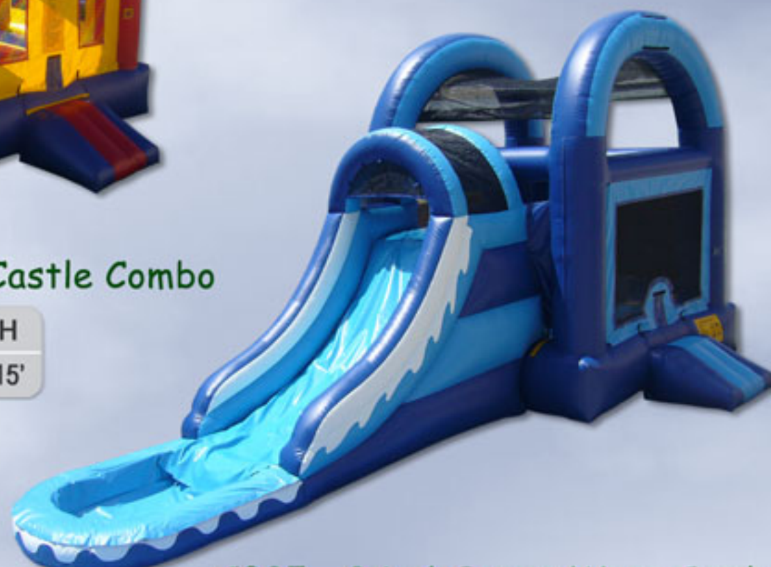
C025 - 3 in 1 Ocean Wave Combo