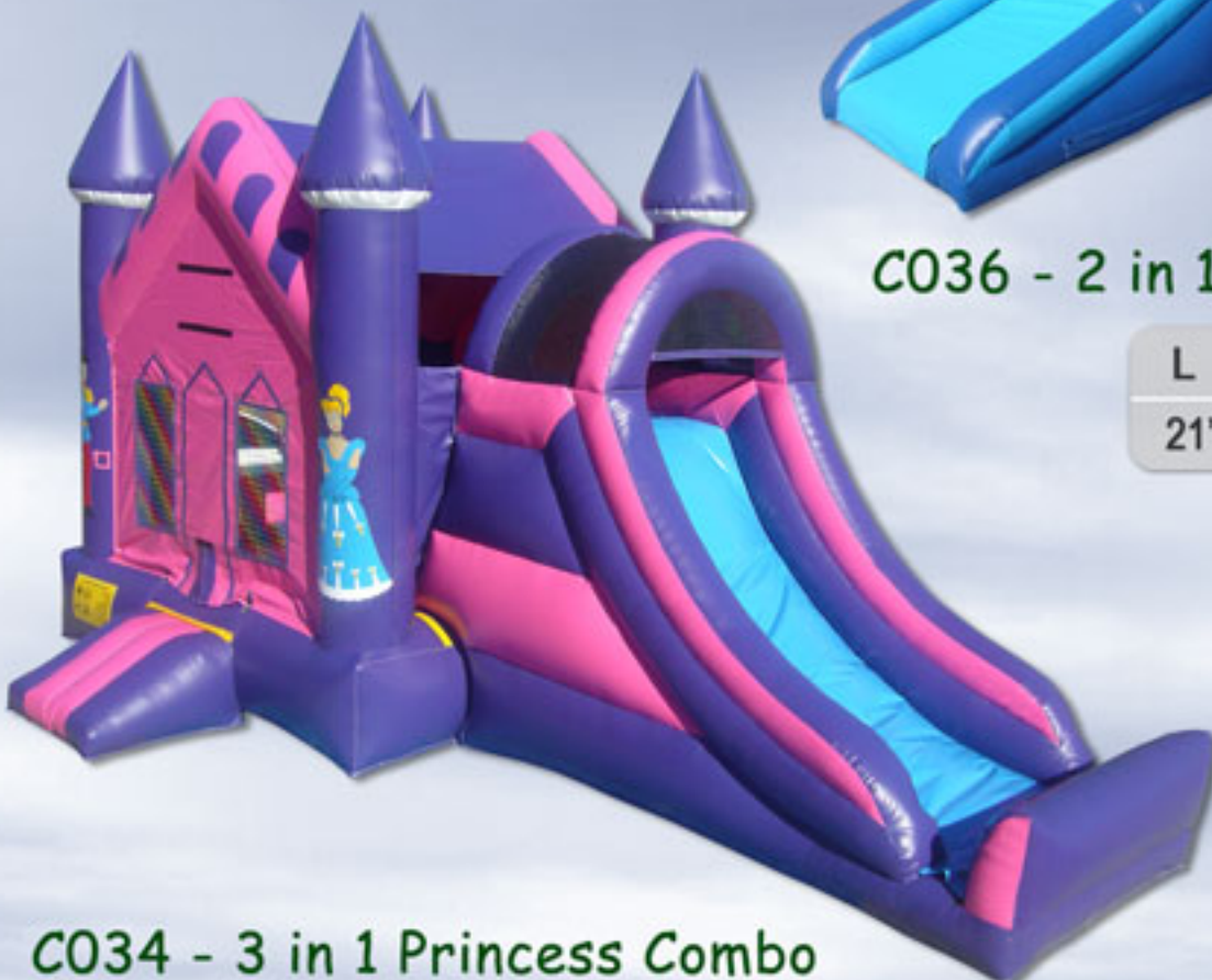
C034 - 3 in 1 Princess Combo