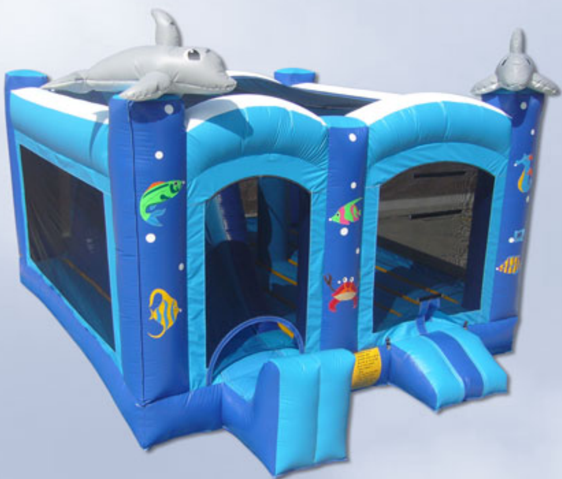
C052 - 5 in 1 Sea World Combo