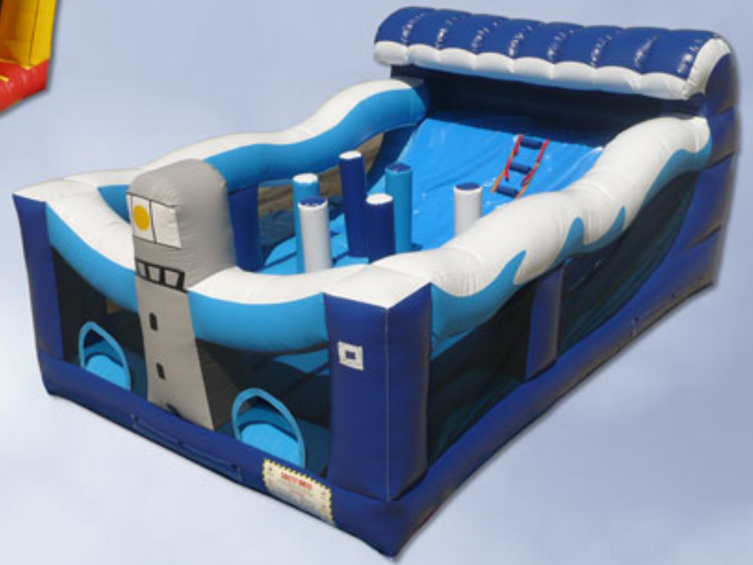
N040 - Lighthouse