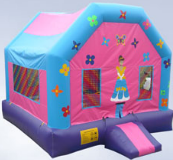
J066 - Doll House