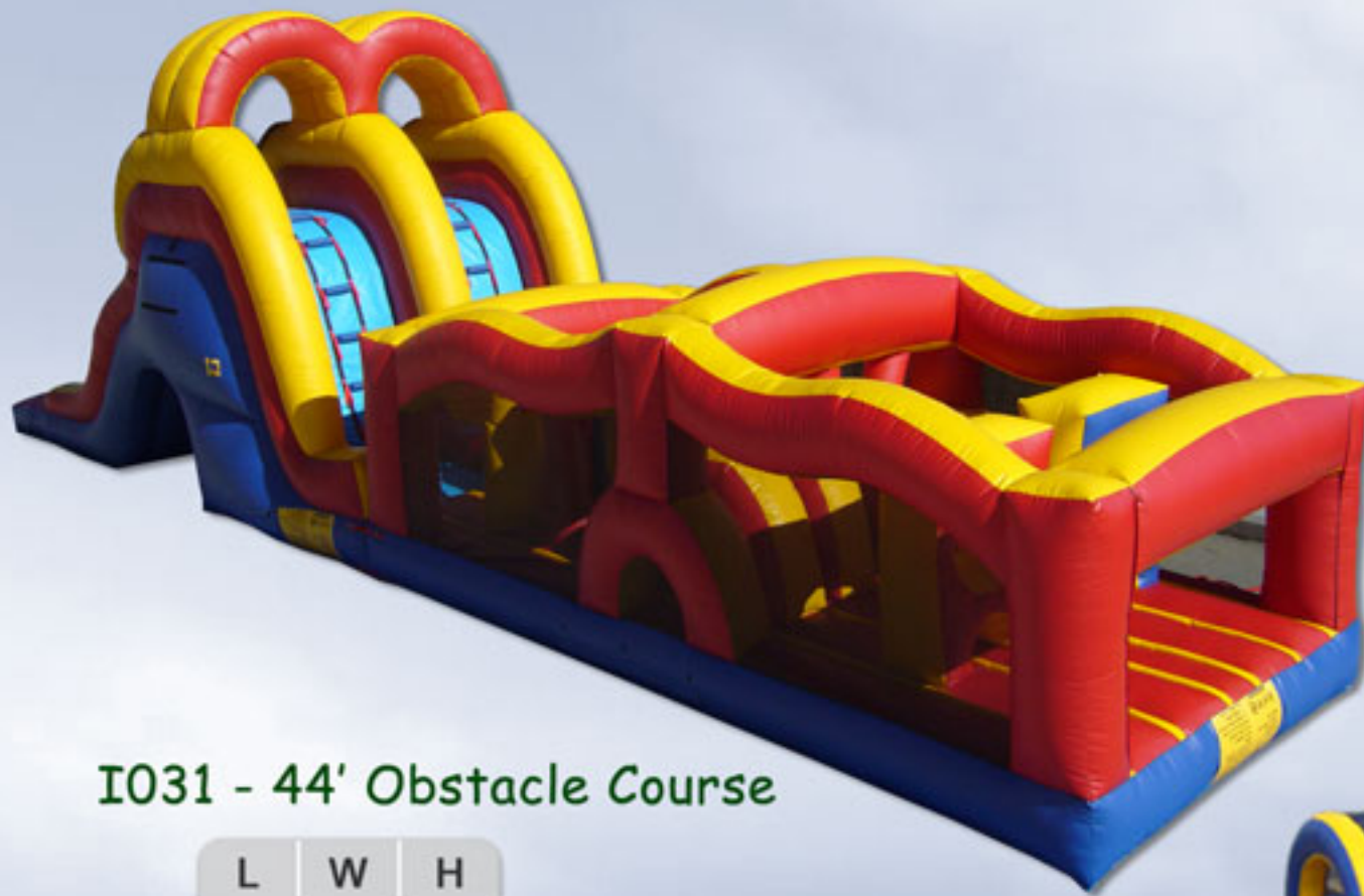
I031 - 44' Obstacle Course