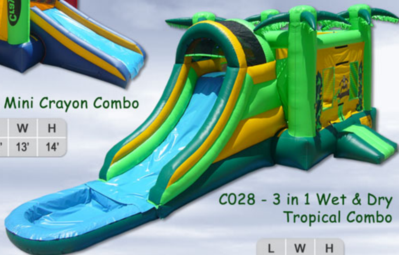
C028 - 3 in 1 Wet & Dry Tropical Combo