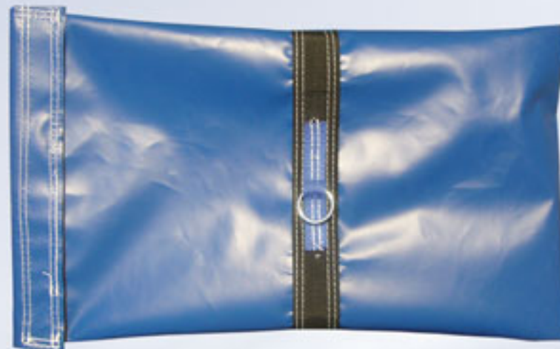
A015 - Sand Bag